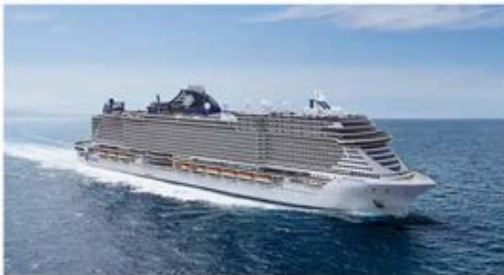
MSC Seashore Ship

Destination Nassau and Ocean Cay Marine Reserve