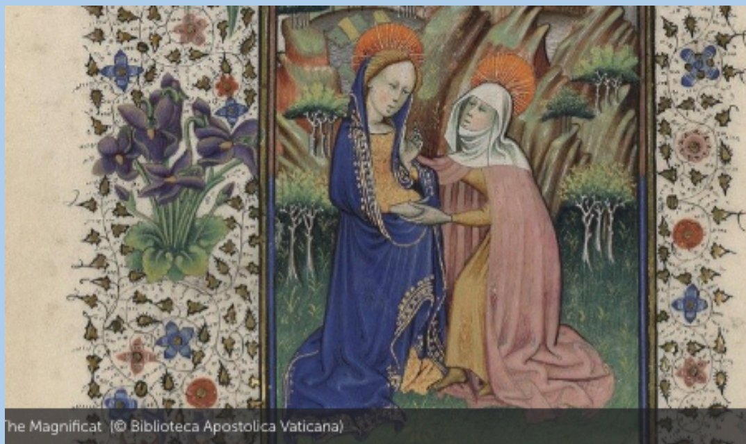
The Magnificat